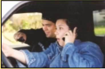
Teens and distracted driving

The TriHealth Think First Program (Cincinnati, Ohio) has collaborated with Freedman, Gibson and White, Inc (public relations firm), the local juvenile court and the Ohio Department of Public Safety in production of a video to address teen driving and passenger safety. Focus group research was conducted with teens who have been involved in crashes and teens who have not to determine what type of message would aid in their decision making regarding driver/passenger safety. From that research we created our message which is presented by teens who had personal experiences with such tragedies. The video focuses on safety belt