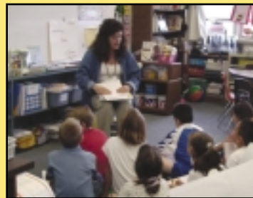
A third grade teacher sharing Think First for Kids with her students

The published research letter can be viewed online at http://ip.bmjournals.com/cgi/content/full/8/3/257