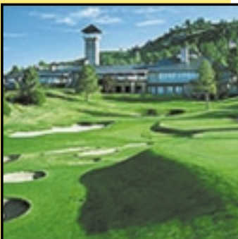
18th hole at The Ridge at Castle Pines North Golf Course, near Denver, CO