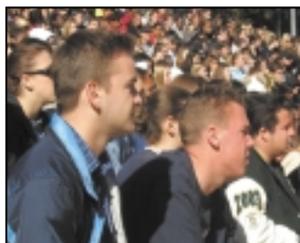
Teens listen to the Think First message.