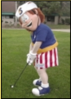
Street Smart teeing off for safety