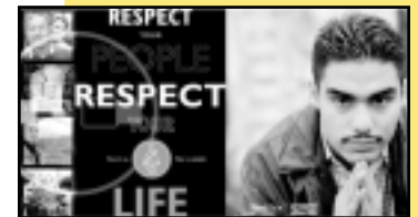
Think First Washington public information campaign ad.

newspaper ads, posters, bus cards and billboards. Targeted markets included high saturation areas including Spokane, Yakima and Seattle. Another unique form of outreach involved personal visits to schools and powwows. Posters were sent to every tribe, tribal school, college, high school and regional health center in the state.