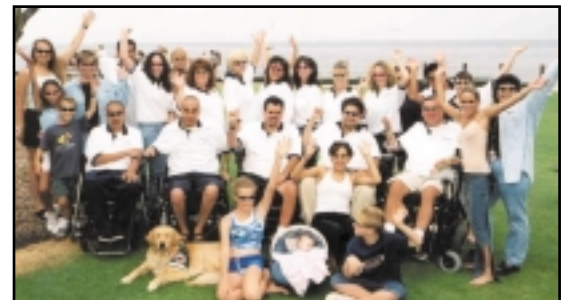
A "Wave" from San Diego

Contact the Think First National Injury Prevention Foundation for registration, CEU's and hotel information at 1-800-THINK-56.