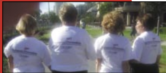
BIOMET handed out 200 "Partners in Prevention" T-shirts at the September 2007 CNS conference

Our first 2008 ThinkFirst Annual Conference corporate sponsorship in the amount of $10,000 was received from BIOMET Trauma, BIOMET Spine. Corporate sponsors contributing $5,000 or more will have their logo featured on our new Partners in Prevention T-shirt (shown below).