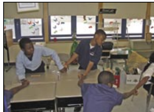
Hands-on activities like acting as nerves sending a message help students remember information

The ThinkFirst VIP Speaker Training Program was made possible by generous support from the Christopher and Dana Reeve Foundation.