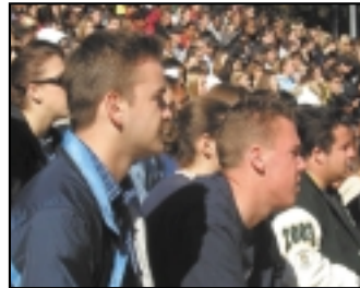
Teens listen to the Think First message.