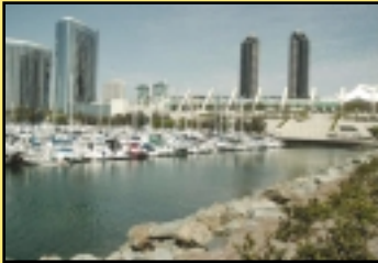
San Diego Marriott Hotel & Marina

Think First... Use your mind to protect your body.