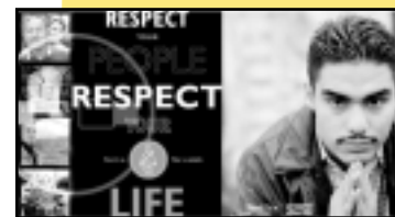
Think First Washington public information campaign ad.

newspaper ads, posters, bus cards and billboards. Targeted markets included high saturation areas including Spokane, Yakima and Seattle. Another unique form of outreach involved personal visits to schools and powwows. Posters were sent to every tribe, tribal school, college, high school and regional health center in the state.