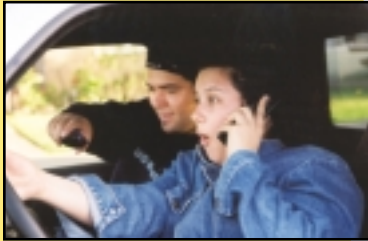
Teens and distracted driving

The TriHealth Think First Program (Cincinnati, Ohio) has collaborated with Freedman, Gibson and White, Inc (public relations firm), the local juvenile court and the Ohio Department of Public Safety in production of a video to address teen driving and passenger safety. Focus group research was conducted with teens who have been involved in crashes and teens who have not to determine what type of message would aid in their decision making regarding driver/passenger safety. From that research we created our message which is presented by teens who had personal experiences with such tragedies. The video focuses on safety belt