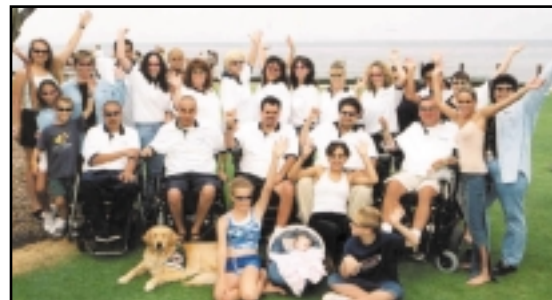
A "Wave" from San Diego

Contact the Think First National Injury Prevention Foundation for registration, CEU's and hotel information at 1-800-THINK-56.