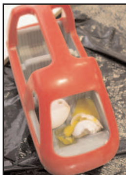
left: The result of an egg crash with no seat belt.

Although the program just began, the team already has many ideas for expanding the scope of Think First within the Madison chapter. Partnerships wait on the horizon, including the Madison Police Department, the Department of Transportation and the University of Wisconsin organ procurement team.