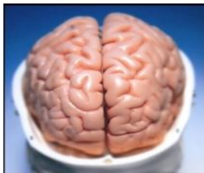
Causes of Brain Injury

The brain is made of nerve tissue, which does not heal in the same way bone or skin is able to.