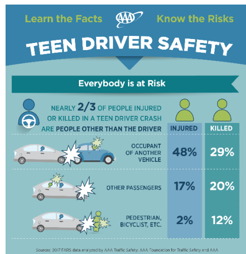
Who is at risk? 8